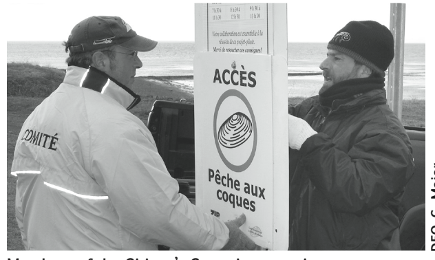
\label{lem:committee} \mbox{Members of the Citizen's Committee putting up posters to raise awareness}

While harvesting is underway, volunteers oversee the activity, identifying the sector's boundaries and access to the clam bed while providing some monitoring and gathering data on the number of clams harvested.